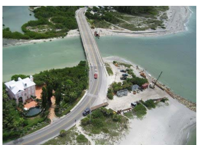
Friday, July 31, 2009 View of Containment Cell Wall Separating the Gulf from Blind Pass