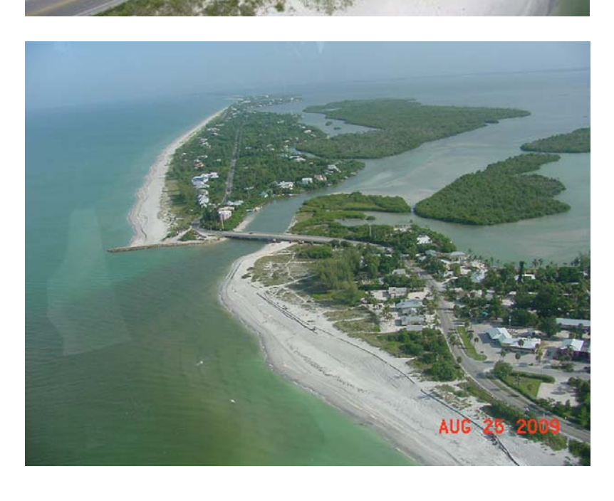
<u>Tuesday, August 25, 2009</u> View of Water Mixing from Pine Island Sound